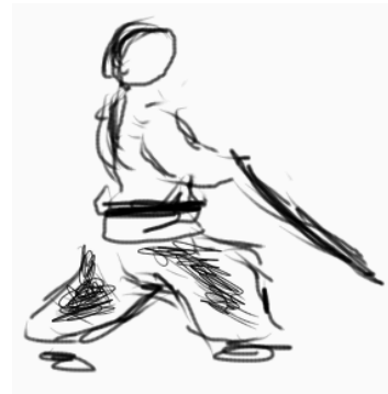
Step back to Gedan (R)