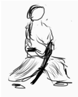
Step back to Wakki (L)