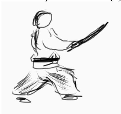
Step up to Chudan (R)