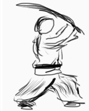
Step up to Jodan (L)